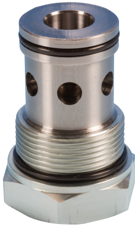
SAE20 Cartridge-350 bar Direct acting-Poppet Type